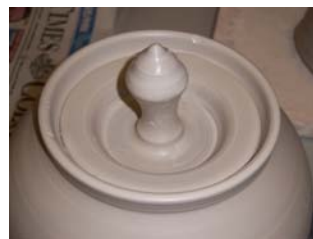
The lid in its gallery