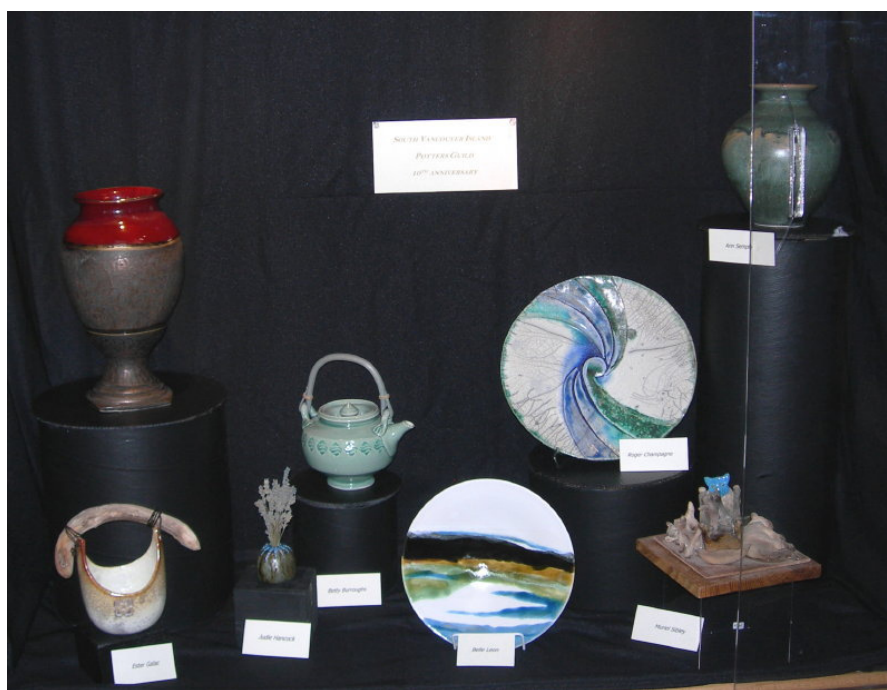
South Vancouver Island Potters Guild display at the Emily Carr Library to April 1, 2010

Try re-firing this to Cone 017 for a really metallic look.