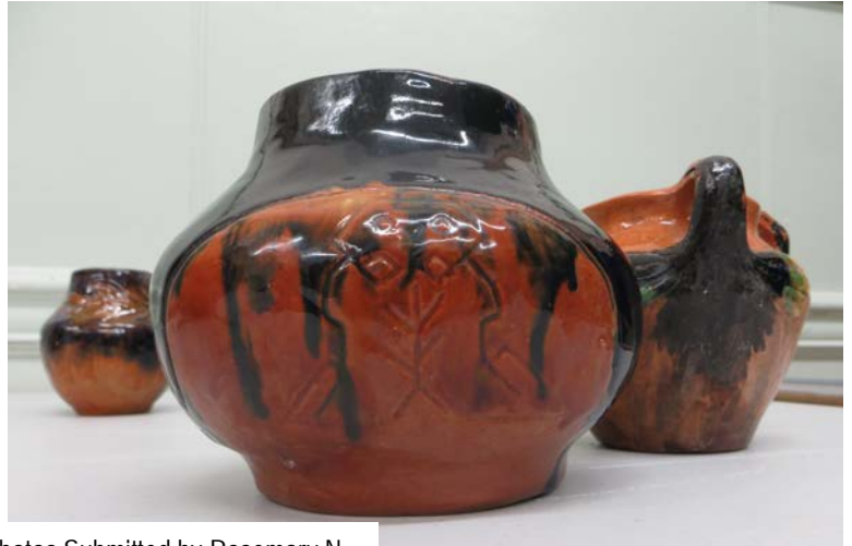
Text Submitted by Pam T-W