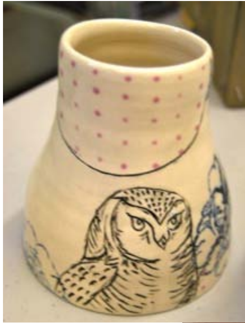
pottery photos & text submitted by Nancy Alexander

Faro uses mylar, found at art supply stores, which she cuts out for a durable and reusable stencil. She applies the stencil onto leather hard clay and pours slip over. Once the slip sets she carefully removes the stencil.